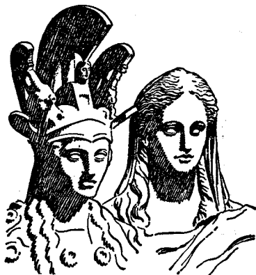
Qâpuc jaŋere qâŋ qâqâtâc

19 Irec no mana wosâerâ zinguc mukopac: Qâpuc guruoneczi Anutu maic-kengopienȳ jaŋe tagi sâko mi râe-jarenȳepenenȳ. 20 Jaŋe nemuqâŋte wiac