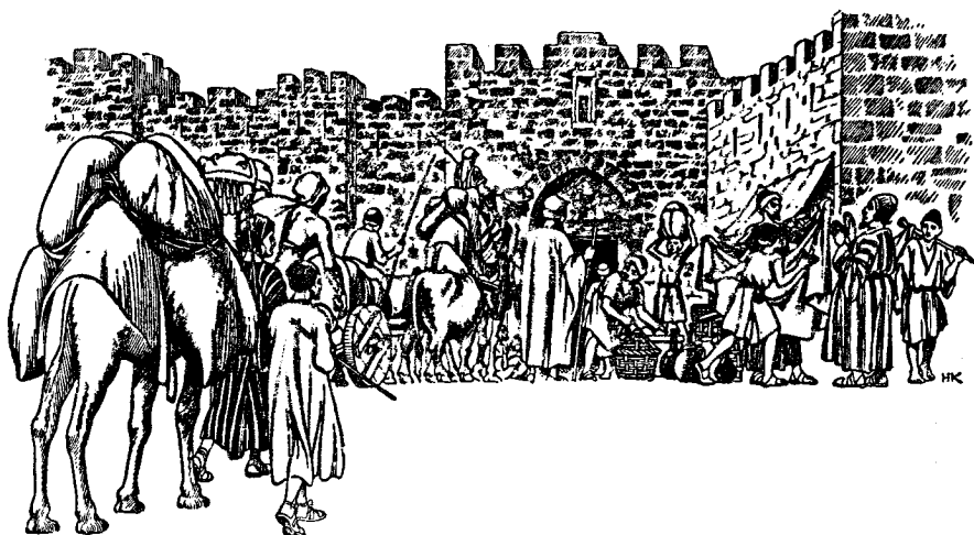
Hae moc qânâsac-ticnehec

6 Eme Ahimelec nokâ-ticne Abiata e taha bapa ngâq rorâ wiserâ Keila hao Dawidirao ra fisiwec: 7 Eham gic gâcne jage Dawidizi Keila hao fisiwec irec birje i Saulo âzâcnembij. Âzâcnepie Saulozi muwec, "Anutuzi menaneo râekac. E jahac hao sacsana-gicnehec ira razime hata zickekne-kac hâcne." 8 Inguc murâ Keila hao hurâ Dawidi â gicfâcne somâc-jopahuc