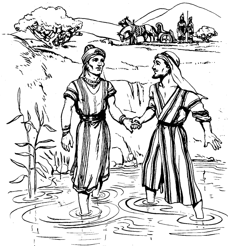
Filipozi Afrika ɲic moc Miti Opâ ruacnewec

34 Eme ɲicbomboŋ e Filipo ziɲuc muhuc wiocnewec: "Go mutec manape, porofete e more iɲuc mukac, e jahacnere me ɲic mocte?" 35 Eme Filipo e porofetere dâŋko iticnehuc Jesure Biŋebian âzâcnewec. 36 Iɲuc ehuc raku opâo fisipic. Eme ɲicbomboŋzi muwec, "Honec, opâ fokac zi; Miti Opâre