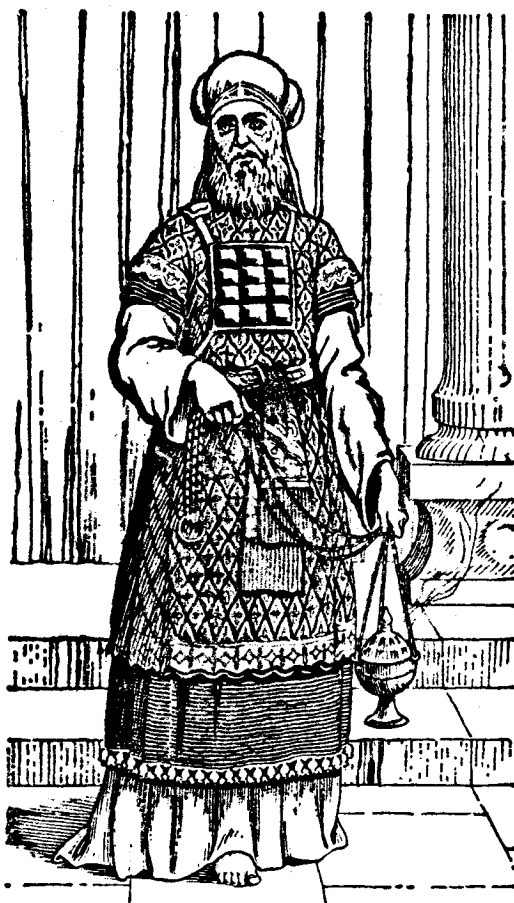
Taha bapa săko

5 Ehame Mose e kikefuŋ ʒiŋuc jazawec: “Wofuŋzi wiac kecʒiŋuc enaŋte