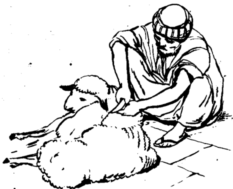
Lama kanɲaɲ bâbâtâc ɲic

26 Wofuɲte aɲelo moczi Filipo zɲiɲuc muhuc âzâcnewec: "Go zawierâ juwickopec, Jerusalem haeconec Gaza haeo huengopieɲ hata ira razemec." Hata i mâreɲ tuhuo fokac. 27 Iɲuc muhuc âzâcneme Filipozi zawierâ rawec. Eme Etiopia mâreɲko ɲokac wofuɲ juwec, zâŋene Kandake, ere ɲicbombon â moneɲ mafa soɲaɲ sâko eki Jerusalem haeo Anutu mai ecneocce rafeweckonec 28 risieocce keretacko rahuc porofete Jesaja ere dâɲqâreɲ wosewec. 29 Iɲuc ehame Mârozi Filipo zɲiɲuc âzâcnewec: "Aɲoc, go ra keretac kecocni bâfuac." 30 Mume Filipozi ra bâfuarâ ɲic e porofete Jesaja ere dâɲqâreɲ wosehame manarâ wiocnewec, "Dâɲ wosekomec irec fuɲne manɲic me?" 31 Eme eki muwec, "Moczi mi nazahame nahackoanɲ wemocko sâcne manapemu?" Iɲuc murâ Filipo âzâcneme keretacko ferâ qâteme ɲepic. 32 Dâɲqâreɲ wosewec ine kecziɲuc: