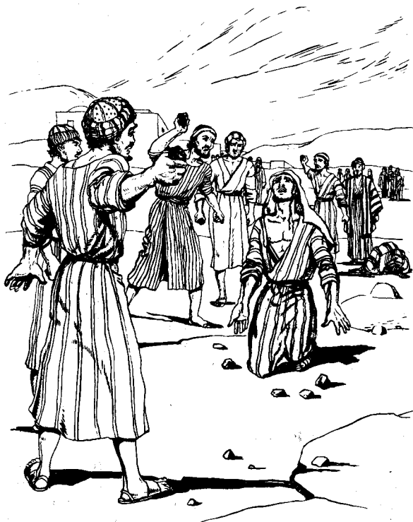
Stefano qânâzi hehâmbin

54 Stefanozi dâŋ iguc jazame bujenic zâzâficne qame aaric sâko manambîŋ. 55 Stefano ine Tiri Mârozi maŋnao fusucmame sambânko fime feme