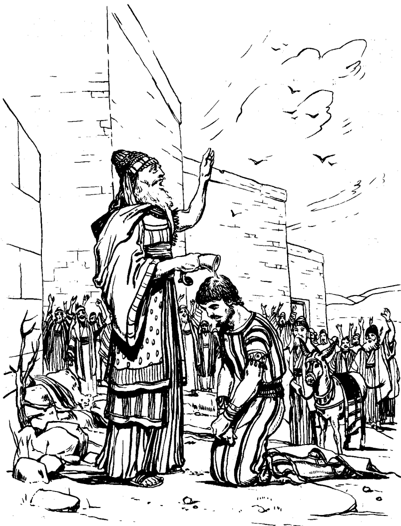
Samuezi Saulo wokemañ ruacnewec

10 Eme Samuezi wokemañ zopo rorâ Saulo qizec-tichao hoñkwec. Erâ muduckehuc muwec, "Wofunzi Israe ñicfâc-ticne micne bajarec- murâ wokemañ rua-garekac. Eme go Wofunze ñicfâc micne bajarehuc râsifâc-jenîc rârec rârec jurangopien jâgere meonec batarac-jopacmurâ wokemañ rua-garekac irec ma zîruc fua-gareocmu: 2 Go miñecgac no