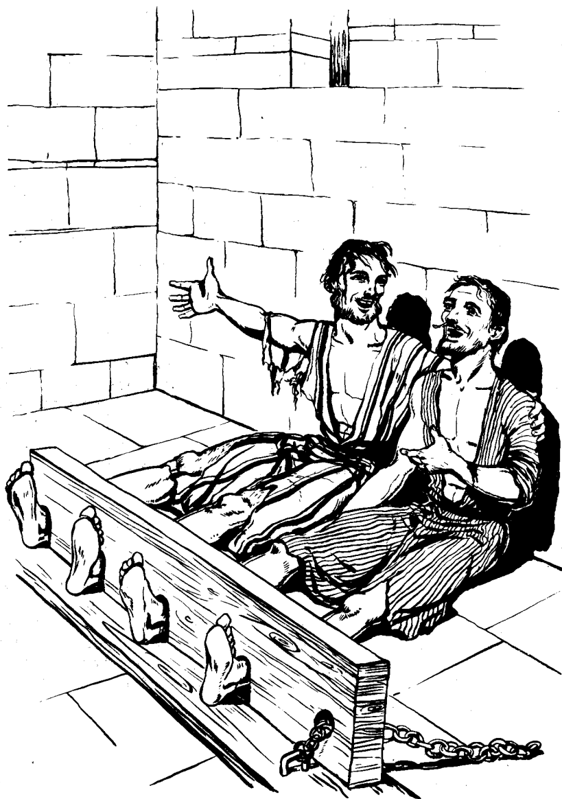
Paulo à Sila jâc tîfîtacko râec-jofakicne

waharâ wio-jacterâ muwec, "Ńicbombon jahec-nane, no weniguc erâ biankepemu?" 31 Eme jahe žiguc âžâcnepic: "Wofun Jesu Kristo manasiŃ-kehuc go â wiacfâcge biankeniŃmu." 32 Iguc murâ e â wiacfâcne WofunŃe dâŃ jazapic. 33 Jazapire sonaŃi gafeoa hefârec-jofarâ kâcbiŃ micrâfâcne žûre-jactewec. Erâ mume e jahacne â wiacfâcne Miti Opâ rua-jarepic. 34 Eme e jahacne ficmaŃko râec-jofarâ mume nânâ rike bâmoc ejactembiŃ. Eme e â wiacfâcne Anuture biŃe embiŃte bujenic biankewec.