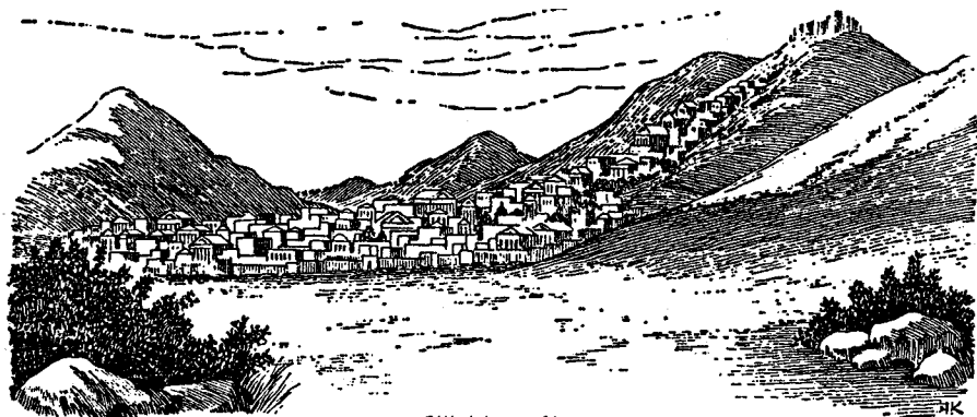
Filipi hae sâko

11 Zawierâ wokeo ferâ Troa hae beherâ fofotâc raku Samotrake nucko fisimber. Hae fureme irecneŋ raku Neapoli hao fisimber. 12 Ira wokeonec