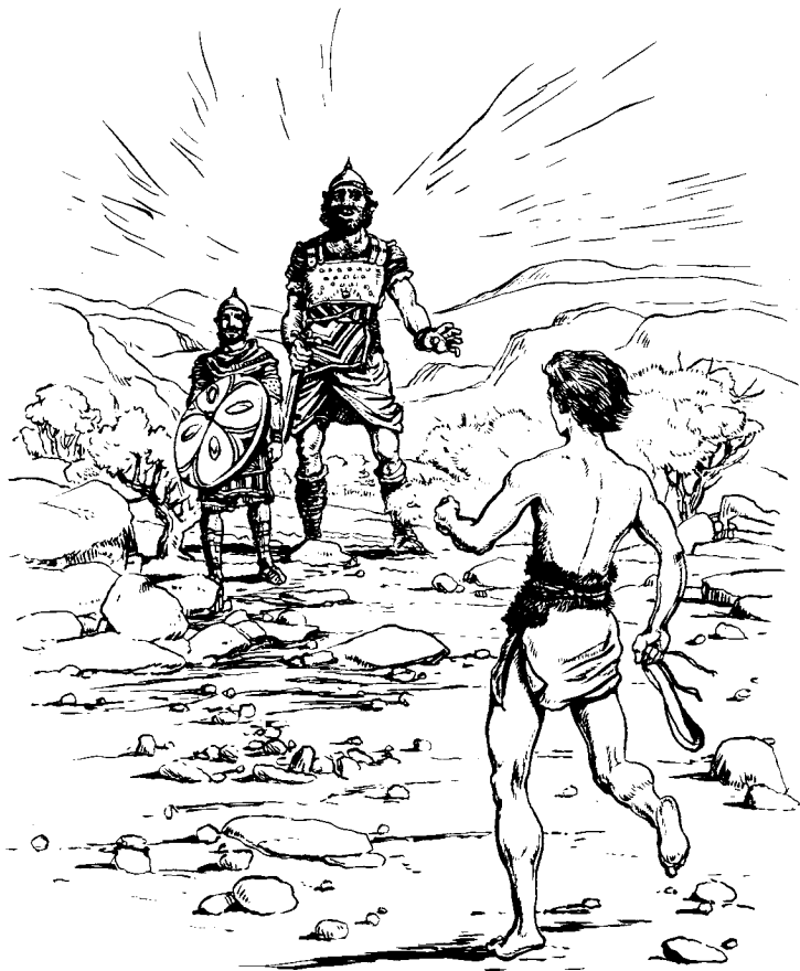
Dawidi â Goliata

46 Miñecgac Wofuñzi nore meo râecguocmu, eme noni qârândingurâ qizecge hetâcnepemu, erâ 30aŋ kec3ira Filisa momori guru qâŋqâŋfâc-jen3ic sawa wipe â kâte qâto mimicne micjen3icko râec-jopapemu, eme mâreŋ sâc 3ic jaŋe Israe kikefuŋ Anutu jujarekac i mana-fâren3epien. 47 Erâ wâc tumañnerâ jungopieŋ 3ic sasawa 3i jaŋe 3iŋuc honen3epien: Wofuŋ e damu 3ika tâmiric râsi sâcne jopaocmu, 3ikao sasanaj â dodocke i Wofuŋte meo fokacte eki menâŋecko râec-jopaocmu.”